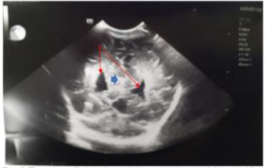
Figure 2: Ultrasound scan of brain showing posteriorly connected single ventricle (red arrows) and fused thalami (blue arrow) suggesting semi-lobar holoprosencephaly

*Permission given by parents to publish photograph